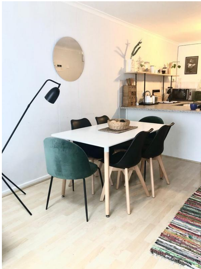
3 Hill Road, Green Point R1, 995 000